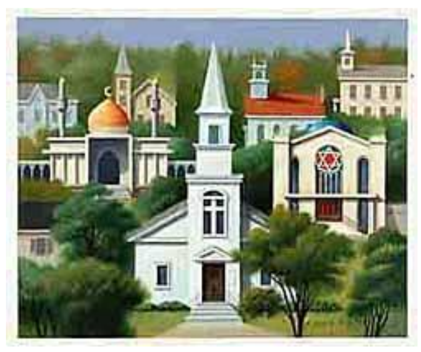
"Freedom of Worship"

As a culminating activity to the study of religious freedom, write an essay in response to the question, "What does religious freedom mean to you?" As you consider this question, think about the painting, "Freedom of Worship," by artist Howard Koslow and comment on the artist's representation of religious freedom. Use the following questions to aid you in reflecting on the painting: